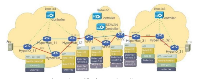
Figure 3 Traffic forwarding diagram

(iii) The controller installs end-to-end SRv6 deterministic paths in the equipment accessed by business applications. The traffic of business applications is forwarded in strict accordance with the end-to-end SRv6 deterministic path to ensure SLA service quality.